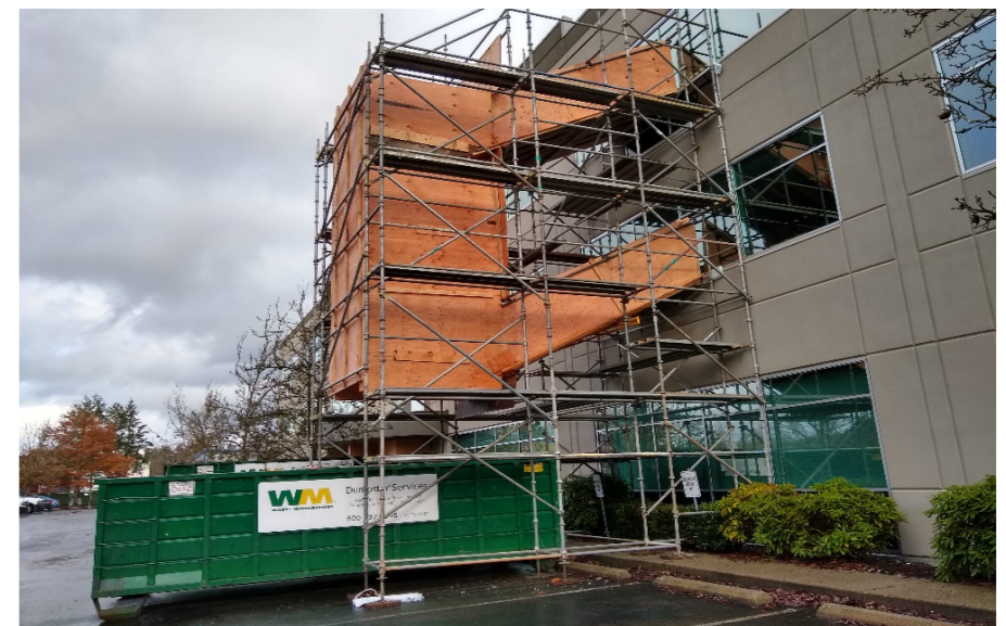
Demo debris removal chute placed.